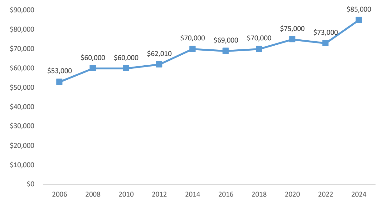
Figure 3. Median calendar year salaries of school-based SLPs who hold the position of clinical service provider, by year.

Note. These data are from the 2006–2024 biennial ASHA Schools Surveys. n = 103 (2006); n = 108 (2008); n = 108 (2010); n = 114 (2012); n = 68 (2014); n = 93 (2016); n = 97 (2018); n = 84 (2020); n = 118 (2022); n = 148 (2024).